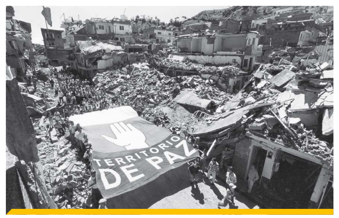
Granada's inhabitants and NGOs marching against FARC and AUC violence in December 2000 Credit: Jesús Abad Colorado Source: "iBasta Ya! Colombia: memorias de guerra y dignitad. Informe General. Grupo de Memoria Historica" – Centro Nacional de Memoria Historica

"In July 2003, President Uribe concluded a peace deal with the AUC in which they agreed to demobilize, and conditional amnesties were proposed for combatants under a controversial Justice and Peace Law, which also shielded top AUC leaders from extradition. AUC troop levels were estimated to be between 8,000 and 10,000, although some press reports estimated up to 20,000. The demobilization officially