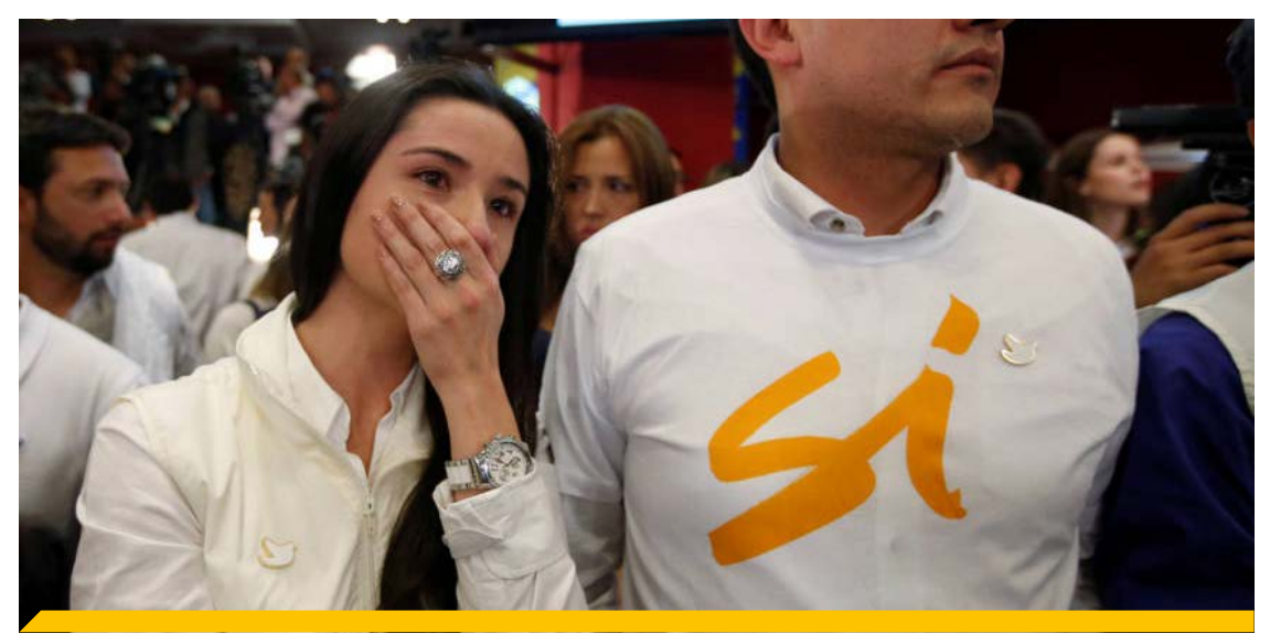
Supporters of the peace deal await the definitive results of the referendum

The FARC are still extremely unpopular with wide sectors of the Colombian public, and the last-minute inventory of their wealth and the news of the UN-supervised destruction of 620 kilograms of explosives did not change this perception. They were deemed by many as excessively late or extremely opportunistic moves. Some have argued this show of protagonism scared and irritated Colombians even further, as the CD had been warning people about the dangers of "castrochavismo", and recalling how recent Latin-American history saw the rise to power of former guerrilla leaders.<sup>119</sup> Fear mongering and misinformation campaign from the Uribe camp played a major role: CD supporters appealed to "the hatred that a portion of Colombian society feels for the FARC, arguing that Colombia would falsely turn into a Cuba-Venezuela like state. Also, the length and complexities of the agreement, most notably the justice section [...], allowed for those wanting to sabotage the effort to distort its contents, generating fear among voters".<sup>120</sup>