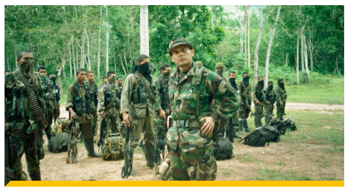
Carlos Castaño Gil, founder and leader of the AUC

Now that the peace deal has reached its final phase, many NGOs and civil society organizations have started pressuring the government for a full and transparent ac-