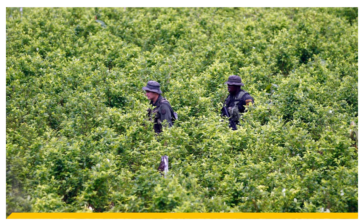
Colombian police walk through a coca field

active role in designing, implementing and monitoring the success of the program. This agreement granted special treatment to the issue of illicit crops by promoting their voluntary replacement and an agricultural transformation of the affected areas. It would have prioritized the legal use of drugs under public health policies, and intensified the fight against drug trafficking: a new strategy was to be established with the aim of dismantling and prosecuting drug-trafficking networks; efforts against money laundering in all sectors of the economy were to be strengthened and new measures to enhance the fight against corruption to be implemented.<sup>74</sup>